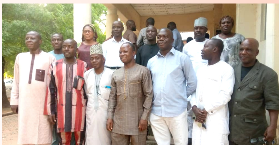
Some CNO and members of IMAP Lafia, Nasarawa State