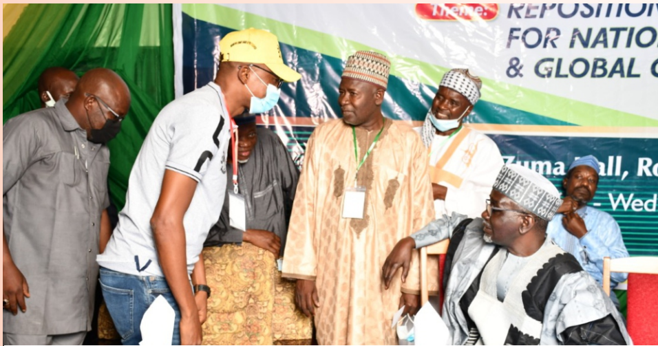
Faces of Participants at the 2021 ASUP Advocacy Roundtable in Abuja