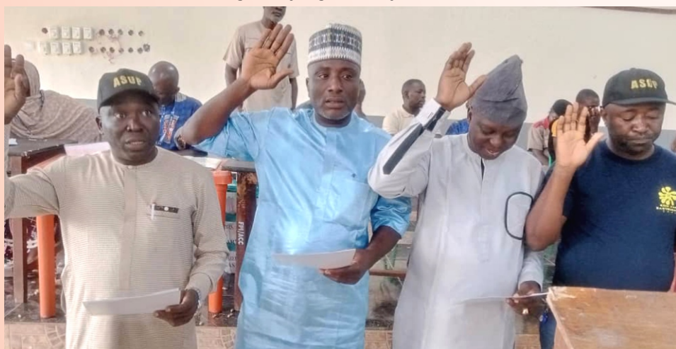
Swearing-In Ceremony of CEC member of Fed. Poly Idah, Kogi State