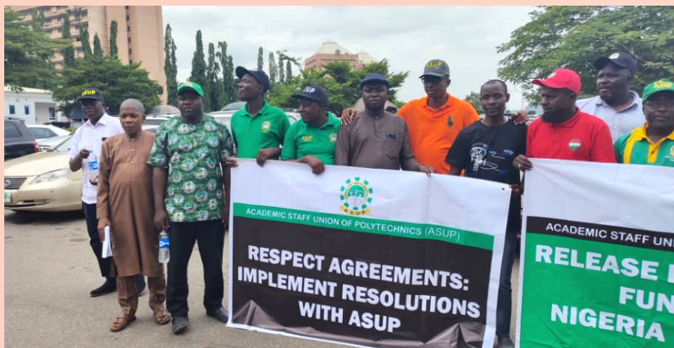
ASUP President and some members at the NLC peaceful procession in Abuja, August 2022.