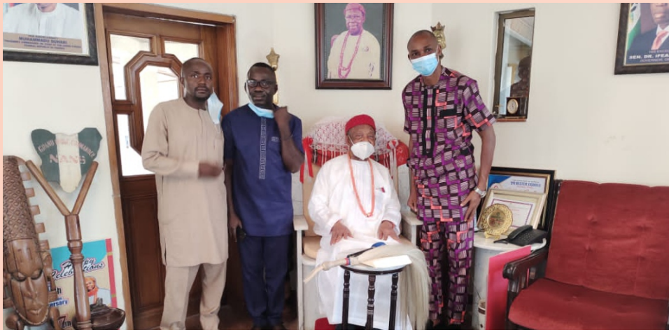
President of ASUP with National Pub Sec & National Financial Sec with the HRH, the Asagba of Asaba; Delta State, during a Courtesy Call on the Monarch