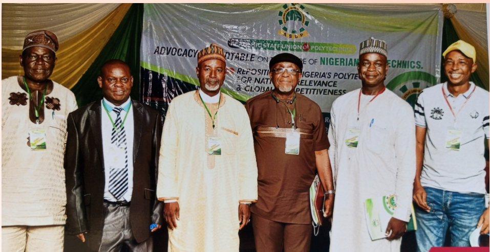
Members of ASUP Think-Tank (former Presidents of the Union) in Chronological Order of Tenure-ship