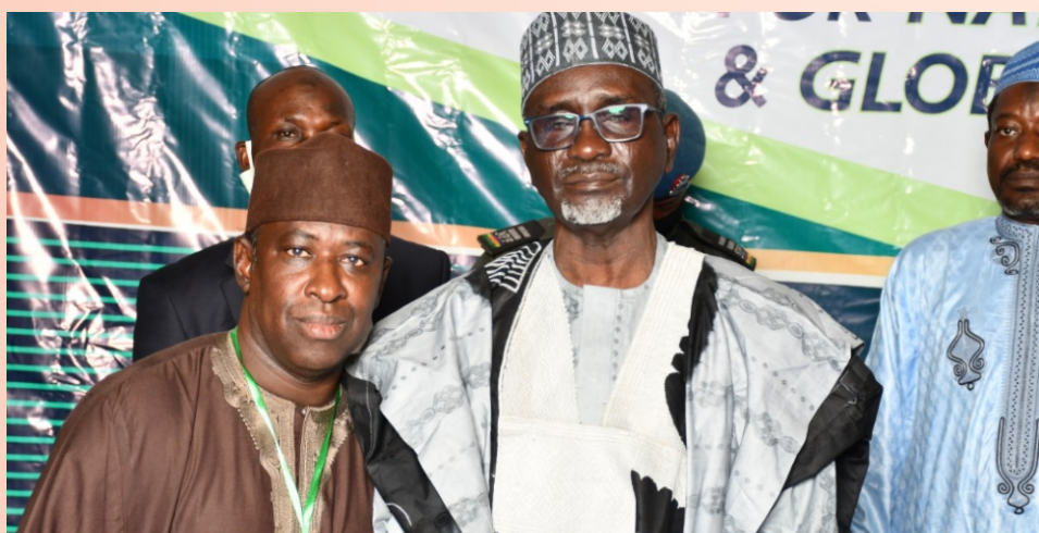
His Excellency, Senator Ibrahim Shekarau, former Gov, Kano State (Middle) at the 2021 ASUP Advocacy Roundtable in Abuja