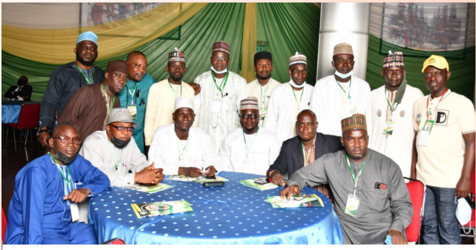
Faces of Participants at the 2021 ASUP Advocacy Roundtable in Abuja