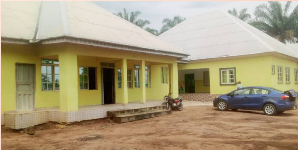
Newly Completed Multipurpose Hall of ASUP, Akwa Poly Chapter