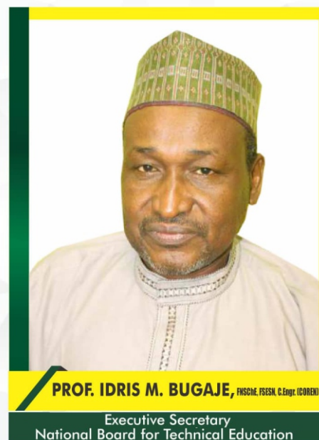
Vocational Educational Training Institutes (TVET) in Nigeria.

NBTE further stated that any institution that fails to meet up with minimum requirements stipulated in the new law, risks suspension of accreditation visits for renewal of programmes.