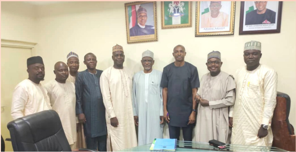
Cross Section of CNO Members with the Hon. Minister of Education, Mallam Adamu Adamu and Chairman of the Committee of Chairmen of Governing Councils of Federal Polytechnics, Arc Waziri Bulama at the Minister's office in Abuja