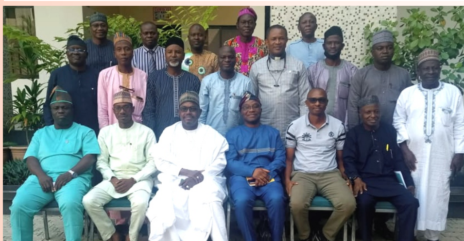
Stakeholders in Abuja, at consideration of ASUP position paper on award of degrees by Nigerian Polytechnics,