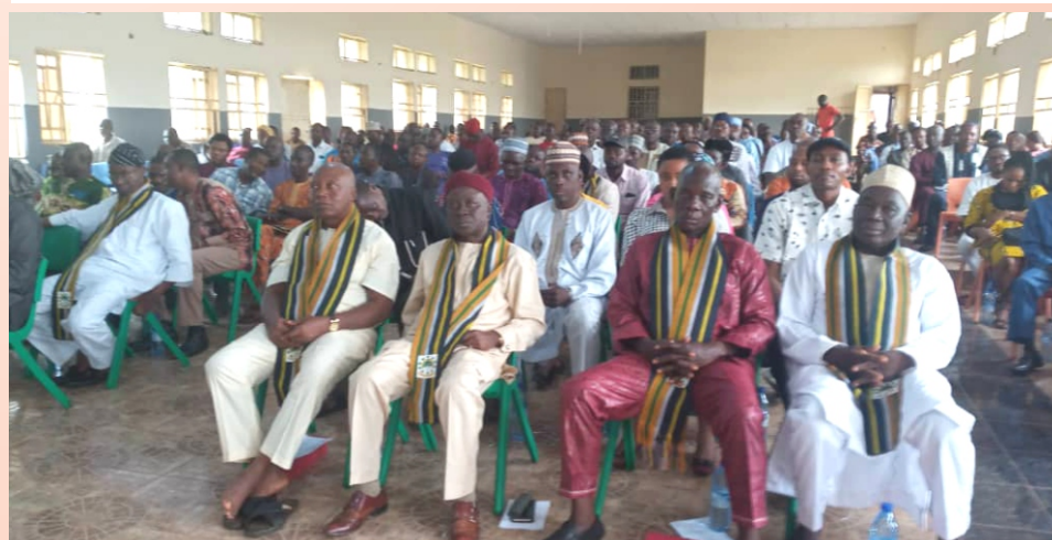
Cross Section of Members at 2022 ASUP Day at FedPoly. Idah.