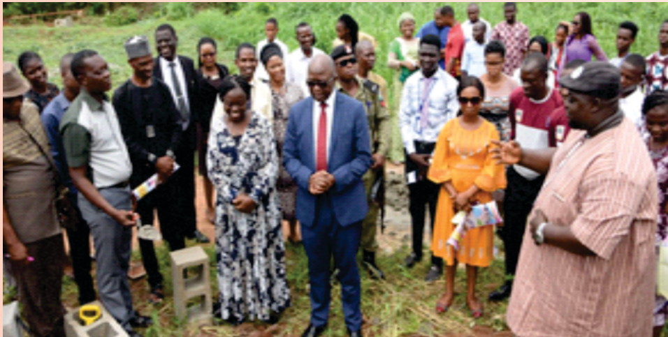
Foundation laying ceremony for the Construction of ASUP Secretariat at Ogun Institute of Technology Igbesa Chapter