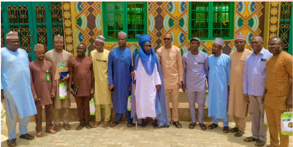
Group picture of the CNO with HRH the Emir of Dutse.