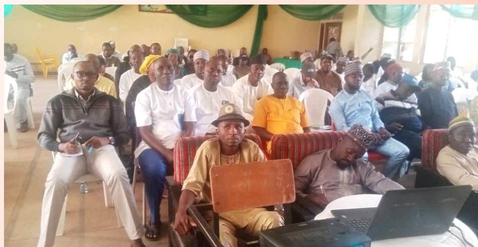
ASUP President and some participants at Zone B (2020) Capacity Building Workshop for CEC members at Plateau Poly, B/Ladi.